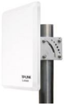
TP-LINK TL-ANT5823B, 23 DBI, 5.15 - 5.85 GHZ, DIRECTIONAL, 100W, 32 CM, 2 CM