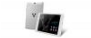
VORAGO 302 PAD, 1,6 GHZ, ROCKCHIP, 1 GB, DDR3-SDRAM, 8 GB, MICROSD (TRANSFLASH)